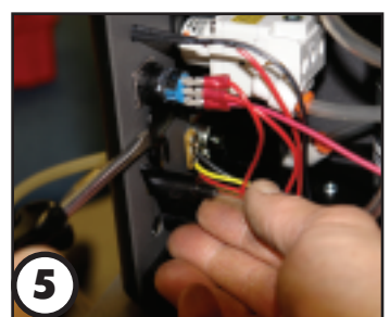
With a medium flat blade screwdriver, gently lift the spring clip outward away from the front panel just enough to clear the valve body locating groove and rotate the valve body counterclockwise 90 degrees.

Make sure the exterior o-ring (#002-333) is still on the valve stem and next to the plastic valve body, then slip the smaller washer over the brass valve stem.